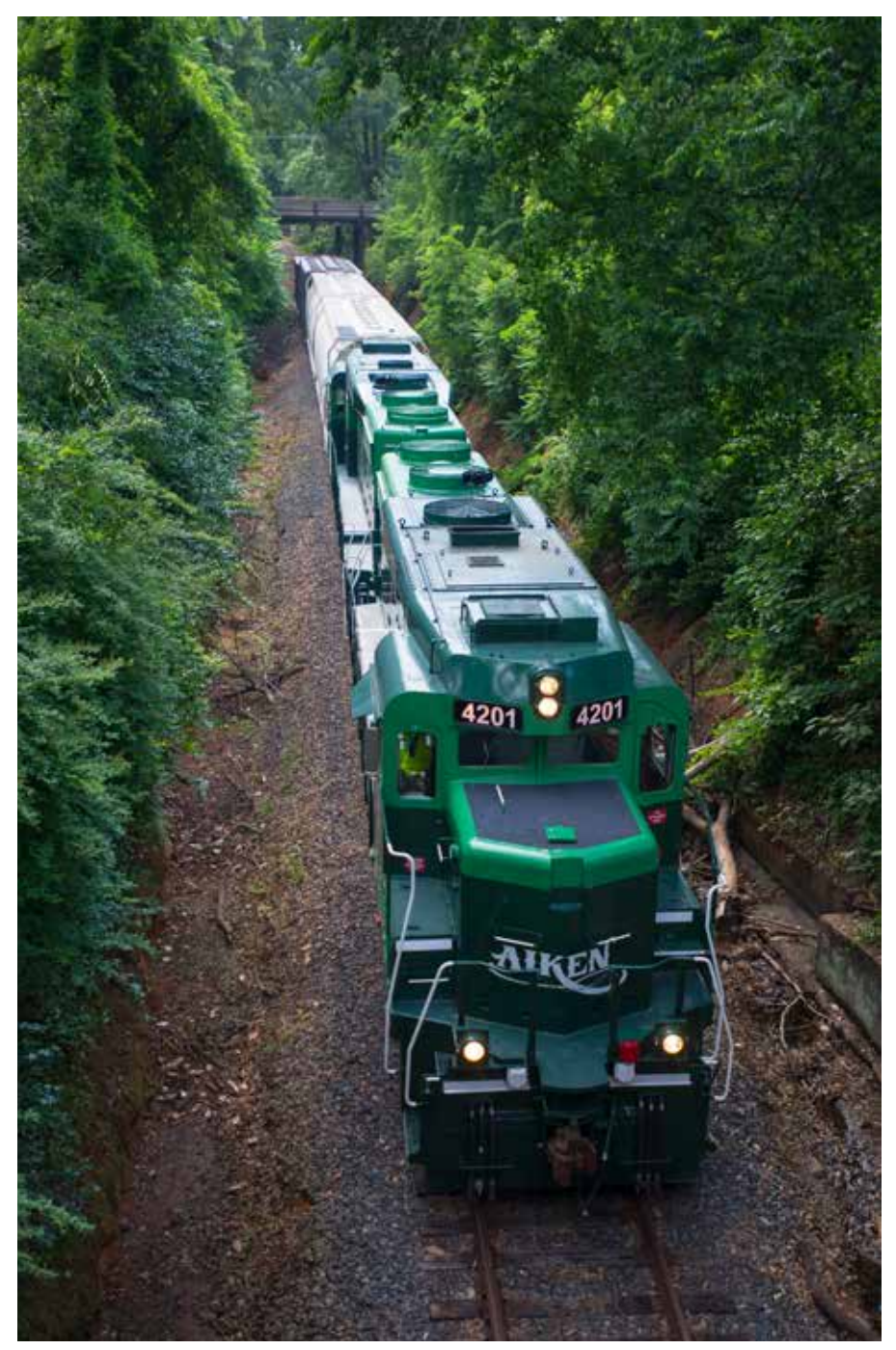
A pair of Aiken Railway GP30s lead a train through the 40-foot-deep cut built in 1852 at Aiken, S.C., that replaced the original incline railway of 1833 to reach this point.

former Piedmont & Northern depot. It's a spacious, splendid old brick and tile-roof structure, built in 1913 and featuring a two-story main station building and a long freight house. The building houses five tenants and is listed on the National Register of Historic Places.