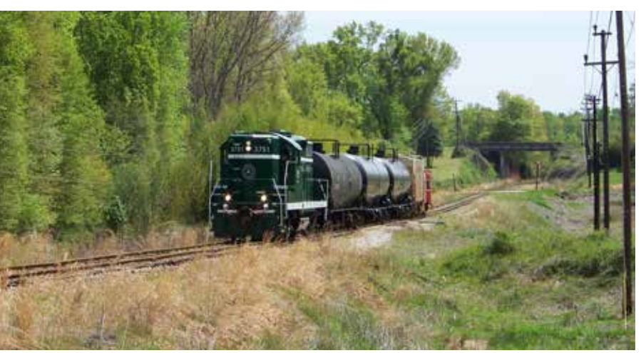
Greenville & Western GP9 No. 3751 leads a short freight along a portion of the former Piedmont & Northern electrified right-of-way at Belton, S.C., in 2009.