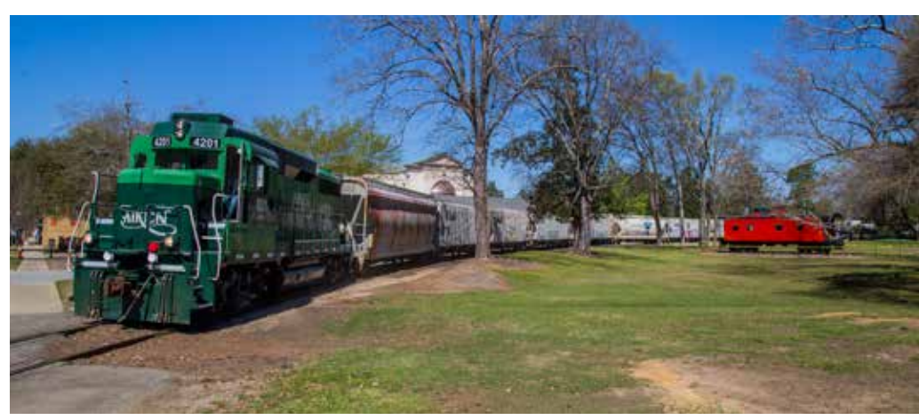
Southbound Aiken No. 4201 passes the replicated Aiken, S.C., depot and a caboose on display on March 15, 2016. No. 4201 began its career as a Santa Fe GP30 in 1963. Grady McKinley

Sharing space at the Belton terminal are two of the company's four GP30s, including No. 4203, repainted in the company's two-tone green Aiken livery, and No. 4204, wearing what might politely be called a mashup of Santa Fe and Greenville & Western identities. Someday it will get repainted, says Hawkins, but for now it works just fine as it is. Also at Belton: a snazzy extended-vision caboose off the Richmond, Fredericksburg & Potomac and lounge car River Falls , formerly Rock Island six-double-bedroom, eight-roomette sleeper Golden Tow er , both used in special moves such as the company's annual Santa train.