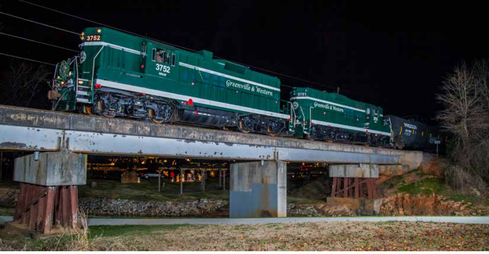
Greenville & Western GP9s Nos. 3752 and 3751 lead a northbound through Williamston, S.C., with cars that will make up an outbound empty ethanol train for CSX. Grady McKinley

contrast. The Greenville & Western is the busiest, generally operating three days per week and hauling 2,400 carloads annually between Pelzer and the railroad's small terminal south of Belton, where it connects with another short line, the Pickens Railway. Its main connection is with CSX at Pelzer, although it also provides overhead service to NS via the Pickens. The Aiken hauls 1,100 annual carloads and operates twice a week from its terminal on the east side of downtown Aiken, a genteel community Southern Living magazine called the "South's Best Small Town" in 2018.