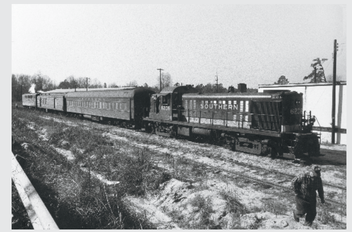
A Southern RS3, coach, post office car, and FTB steam heater car comprise a Dec. 16, 1966, remnant of the Augusta Special in Warrenville, S.C. This service ended soon after this image was made.

GP30s are kept at the company's small yard just east of downtown Aiken. Regular running maintenance is performed on site; for heavier work, the company relies on the services of Republic Locomotive, a rebuilder and manufacturer in Greenville.