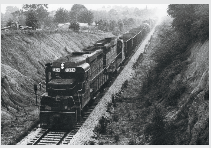
Seaboard Coast Line GP30s hustle 16 cars through Greer, S.C., on July 10, 1974, on the former Piedmont & Northern trackage. This portion is north of Greenville & Western rails but gives a feel of the SCL era.